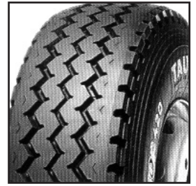
TOP 420 / 2000 UO