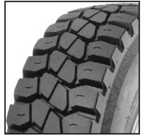
TOP 2000 DO