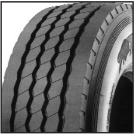
TOP 2000 F