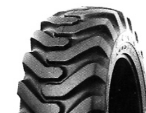
SURE GRIP LUG GOODYEAR