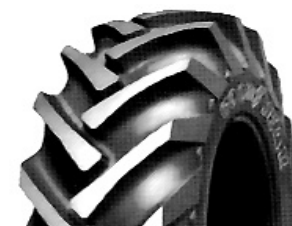
SURE GRIP IMPLEMENT GOODYEAR