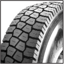
TOP 2000 D