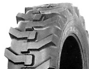
SURE GRIP INDUSTRIAL GOODYEAR