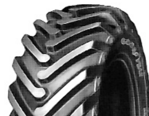
INDUSTRIAL SURE GRIP GOODYEAR