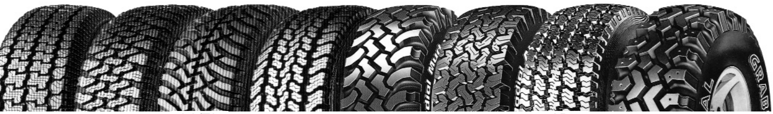
FK/AP FK/AT LA/TA LA/AT MT AT AP MT